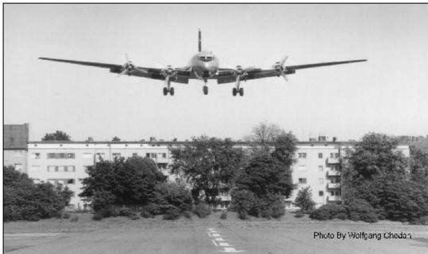
C-54E "Spirit of Freedom" on approach to Tempelhof Airfield in Berlin